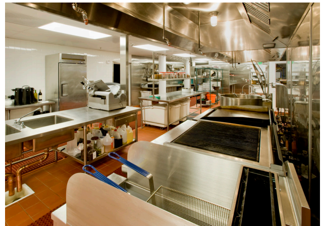
This photo illustrates the correct installation of a metal baffle plate between the open flames from the range and the deep fat fryer. Metal baffles should be used only when there is not sufficient space available to provide a 16" clearance between the deep fat fryer and any source of open flames. Baffle filters are seen above the range and fryer.