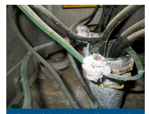
Fig. 6 — Salt residue engulfs a conduit bonding clamp. Corrosion will continue until the salt or clamp is consumed.