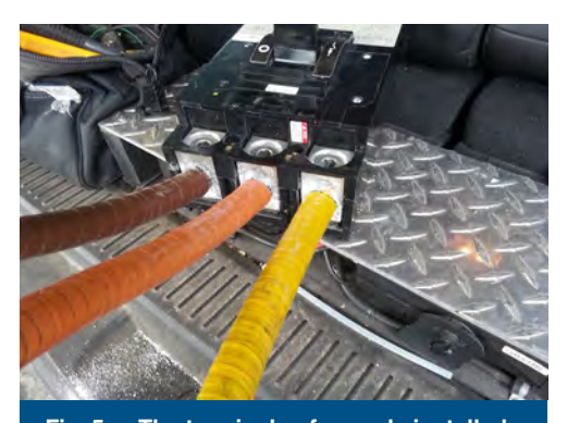
Fig. 5 — The terminals of a newly installed breaker corrode due to saltwater wicking from the existing conductors. The salt water wicked up from the wires terminated at the bottom of the breaker.