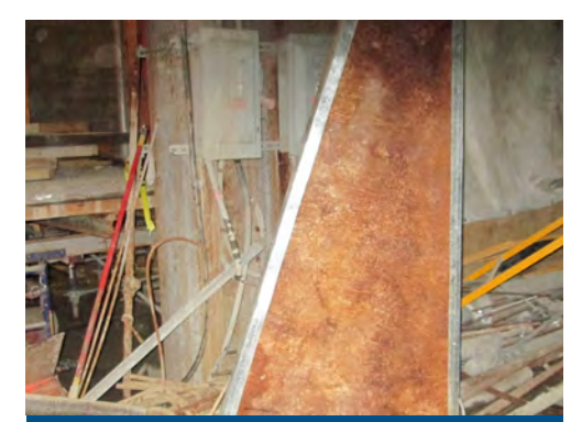
Fig. 7 — Section of ductwork that had been submerged in sea water during Hurricane Sandy. If the surface is not improved, additional drag from the roughened surface will affect system energy consumption.

Components of fire suppression and water systems are as susceptible to the damaging effects of salt water flooding