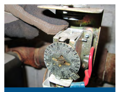
Fig. 2 — This boiler over-temperature safety switch is corroded in place. It will not activate when needed, compromising safety.