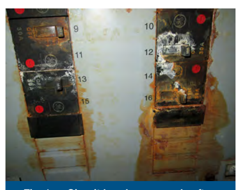
Fig. 1 — Circuit breakers corrode after salt water submersion.

Electronic devices have the same susceptibility to saltwater corrosion as electrical devices, but with the added concern for lamination degradation. The coatings on many types of printed circuit boards, motor windings and transformer ballasts are attacked by the residual salt. In the presence of condensing water vapor, the remaining salt residue can provide enough of an electrical pathway to cause a short circuit. In the case of the ballasts, a short circuit can occur without the presence of condensation if the lamination of adjacent, closely wound wires deteriorates from the salt.