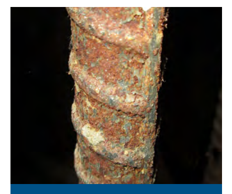
Fig. 9 — Corrosion-induced scaling of this rebar may prevent proper concrete adhesion unless properly cleaned.