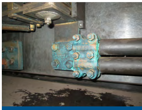
Fig. 4 — This termination point, cleaned twice, continues to corrode due to salt water wicking from the associated conductor.

The salt water and salt residue on the wire can be conductive enough to expose flaws and weaknesses in the insulation sheath of the wire. Although most sheath